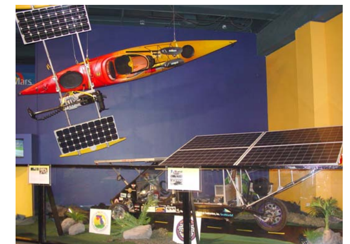
Students from the South Plantation High School Environmental Magnet School displayed their solar powered car and kayak during the Climate Change Show exhibit.