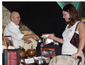
The Melting Pot joined us for Insect Crunch 'n Munch. Visitors sampled chocolate covered grasshoppers and crickets.