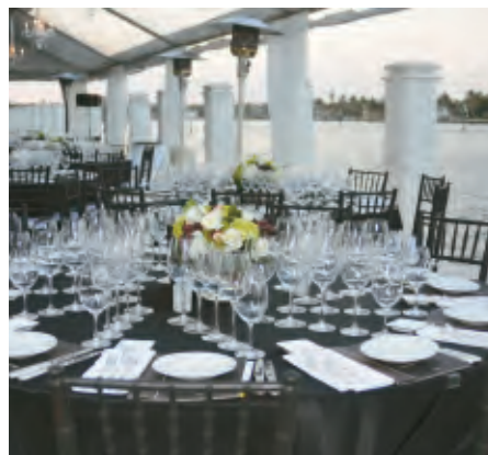
Guests were treated to a gourmet dinner on the water at the magnificent Von Allmen residence.