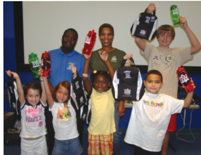
Whole Foods Market provided lunch packs, t-shirts, water bottles and healthy snacks for Camp Discovery participants Summer 2009.